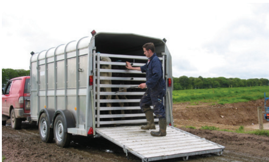
Always unload stock away from the home herd and keep them quarantined for a minimum of 4 weeks. Check animals regularly when in quarantine.