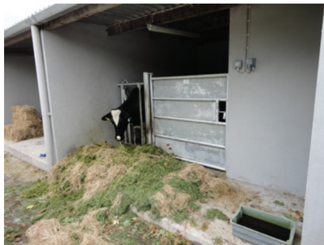
Isolate cattle on arrival on farm and implement a quarantine period as part of your Bioexclusion plan

As well as introduced cattle presenting a disease risk to your herd, your cattle also present a disease risk to the introduced cattle. In order to protect the introduced cattle from these disease risks a quarantine period can also be used to implement reverse biosecurity measures such as treatment, checking for pregnancies and vaccination. However, existing infectious disease problems in your herd (e.g. respiratory diseases), present a risk to the health of the introduced cattle after they are released from quarantine. Hence, knowledge of and control of infectious diseases in your own herd is as important as controlling the risk of introducing infectious disease in purchased cattle. See the AHI Biocontainment leaflet for further information on this.