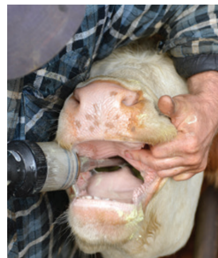
Dosing on arrival should be considered