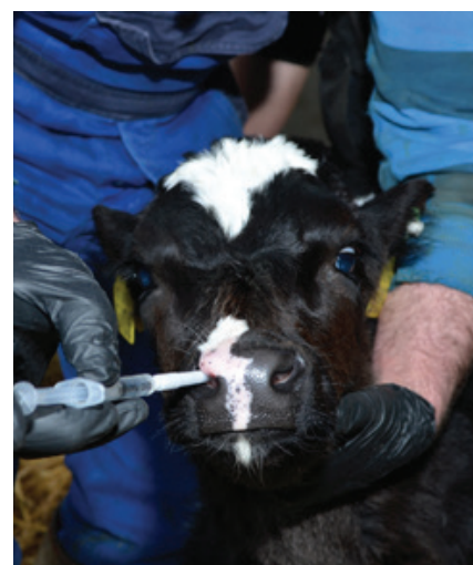
Vaccination is an effective tool

Specific advice on measures that should be taken for IBR control and parasitic disease control after new animals arrive on farm is contained in the AHI parasite Control TWG leaflet series, and the 'IBR - The facts' information leaflet which are available on the AHI website.