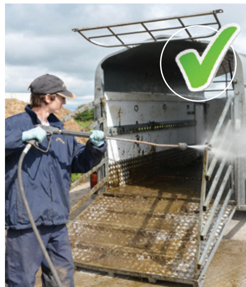
Ensure the transport vehicle is clean and disinfected before use